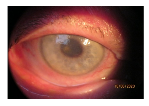
Fig. 1 RE (OD)

To show some interesting cases from our practice, we presented Patient 1, of 35 years old. She had uveitis and uveal glaucoma due to rheumatoid arthritis and was treated with steroids (orally, eye drops, intramuscularly). OS (left eye) was operated for cataract, but the eye lost function due to a complete retinal detachment. IOP in the right eye had risen. IOP stabilized after the disappearance of uveitis. Visual acuity stabilized despite progressive lens opacity (0,5 nc). Patient 1 continued to be treated by a rheumatologist [8]. The figures below show her eyes on anterior segment photographs ( Fig. 1,2 ).