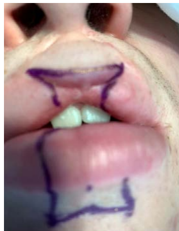
Fig. 3. Abbe flaps for upper-lip replacement have always made the full height of the upper lip regardless of the amount of skin being replaced; lower-lip replacement flaps were boxed (not triangular) and tailored at any level necessary

All patients were placed on a clear liquid diet for one day, a pureed diet for two days, and then onwards normal diet. Tooth brushing was encouraged. Internal prostheses were always removed. In the office, 2,5 to 3 week after the reconstruction, the pedicle was injected with 1 to 2 ml lidocaine with epinephrine 1: 200000. After 10 min, the flap was divided with a No. 10 blade and inset. Mucosal tissue was undermined for closure; however, no significant mucosal adjustments were made. Resorbable sutures were placed in the oral mucosa.