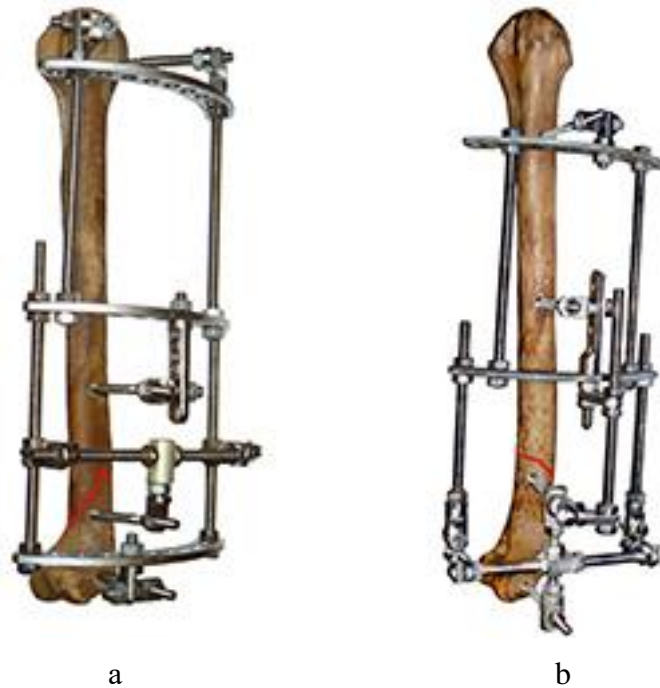
Fig 1. Devices for transosseous osteosynthesis of diaphyseal fractures of humerus at the level of the lower third: original (a) and improved (b) design layout

shortcomings and increasing its repositioning capabilities, we changed, first of all, the layout of the repositioning support structure (Fig. 1).