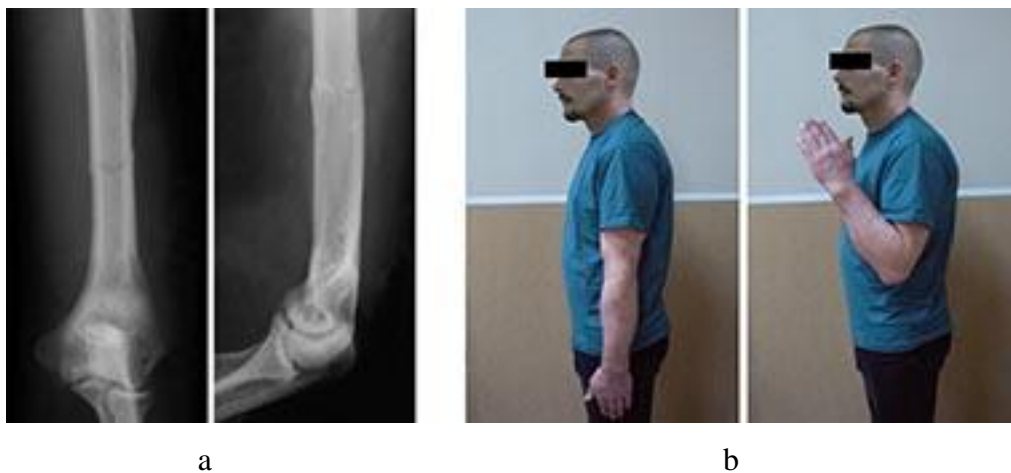
Fig. 4. Photographs of control radiographs (a) and functional result (b), 12 months after treatment

During operation the displacement of bone fragments was eliminated, the axis of the limb was restored (Fig. 3-a). In order to prevent inflammation of soft tissues in the postoperative period the patient underwent antibiotic therapy, dressings with antiseptics. Exercise therapy of adjacent joints was conducted. The wound healed by primary intention, the sutures were removed on the 10th day, the patient was discharged from the hospital for outpatient observation with a range of motion in the elbow joint - S: 20°/ 0 /100° (Fig. 3-b). The apparatus was dismantled in 3 months after the operation, at the same time the restoration of the radial nerve was established. During the control X-ray examination in 12 months after the injury, the fusion of bone fragments was determined (Fig. 4-a). During a clinical examination, the restoration of the range of motion in the elbow joint was established in full - S: 0°/ 0 /150° (Fig. 4-b).