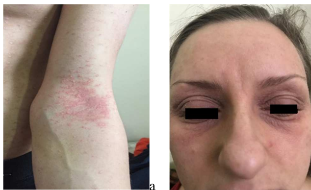
Fig: 2. Atopic dermatitis affects the flexor surfaces of the limbs, including the neck, face (SCORAD \geq 25 –50)

Before conducting clinical and laboratory studies and carrying out therapeutic measures, all patients under our supervision were asked to fill out a questionnaire that allowed to identify the main trigger factors in various clinical forms of the disease. The most frequently mentioned trigger factors for atopic dermatitis were: food and non-food allergens, stress, seasonality, infectious diseases, inappropriate therapy. Food (40 %) and non-food allergens (24 %) were the main causes of exacerbation of atopic dermatitis in the group of patients under our supervision. Among food allergens, the following histamine liberators were most common: cow's milk, eggs, seafood, citrus fruits, honey, tomatoes, chocolate.