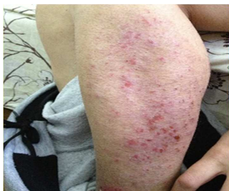
Fig 1. Widespread AD without topographic association (SCORAD \geq 50 )